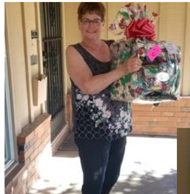
A few of the happy winners